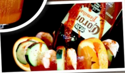
MICHELADA VICENTE FERNÁNDEZ...19. 99