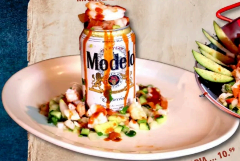
SOLITARIA ... 10. 99