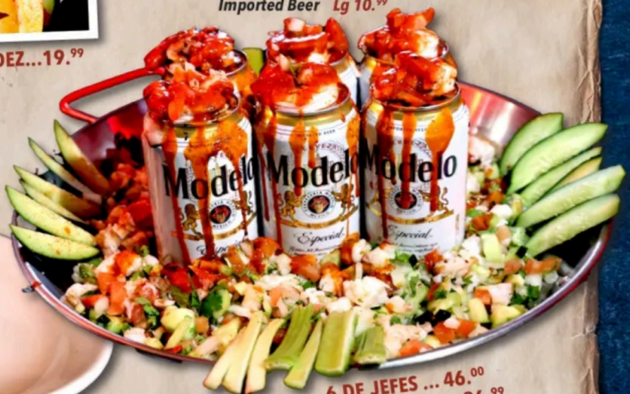
6 DE JEFES ... 46. 00 12 DE JEFES .... 86. 99 18 DE JEFES ... 125. 99