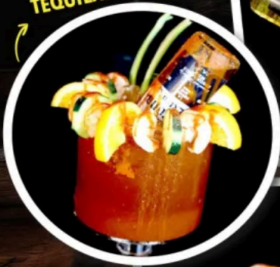
MICHELADA LOS TEQUILAS...15. 99