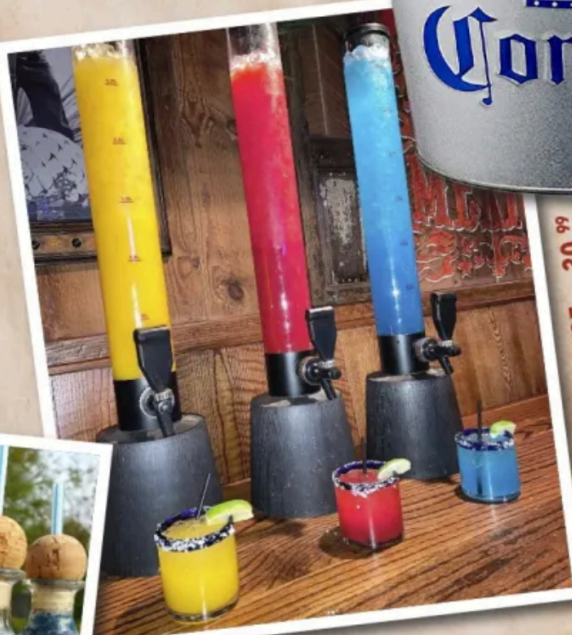
MARGARITA TOWER 80 OZ ... 30.99

Cuervo Gold José Cuervo Sauza Hornitos El Jimador