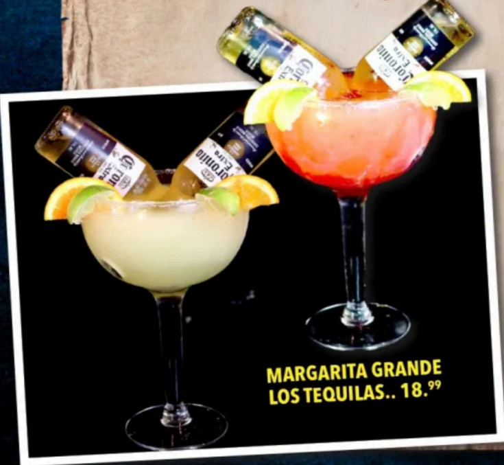
MARGARITA GRANDE LOS TEQUILAS.. 18. 99