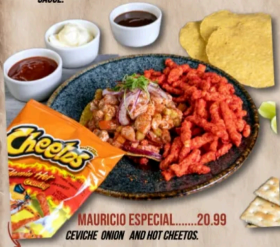
MAURICIO ESPECIAL ..... 20.99 CEVICHE ONION AND HOT CHEETOS.