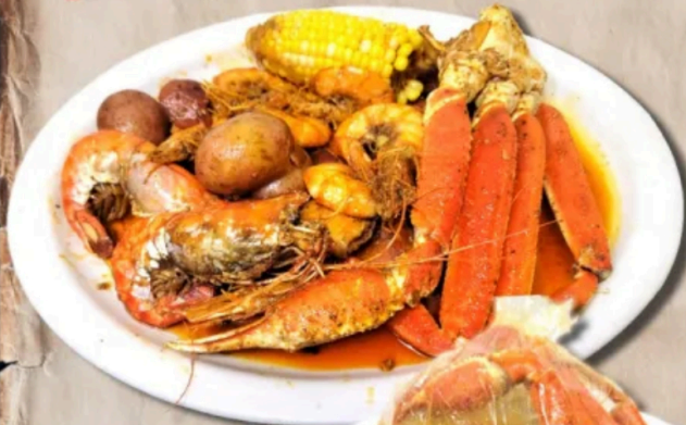
SERVED LIKE THIS OR LIKE THIS SEAFOOD CENTENARIO ..... 30.49 CRAWFISH, SNOW CRAB, SHRIMP, SMOKED SAUSAGE, POTATOES, CORNS, AND A SPECIAL SAUCE.