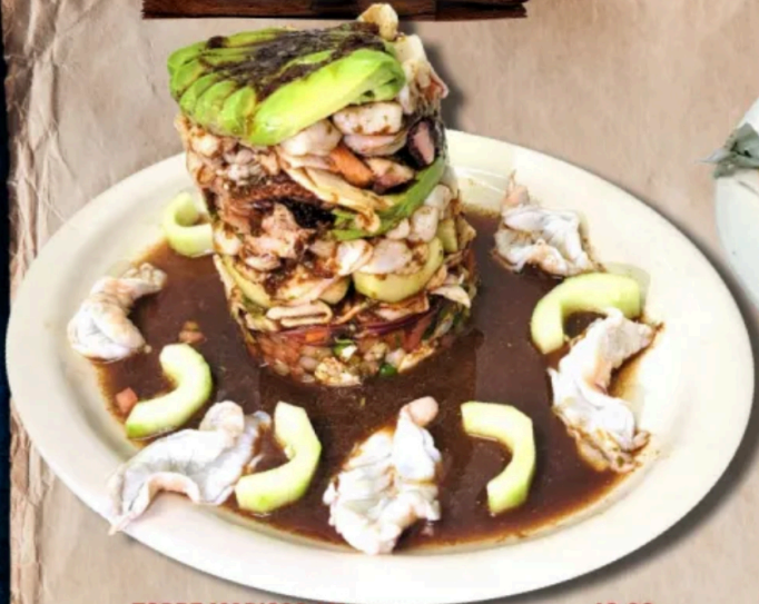
TORRE MARISCO JAL ..... 40.99 SHRIMP CEVICHE MARINATED IN LEMON, IMITATION CRAB, SHRIMP IN AGUACHILE, COOKED SHRIMP, OCTOPUS, SCALLOPS AND BLACK SAUCE.