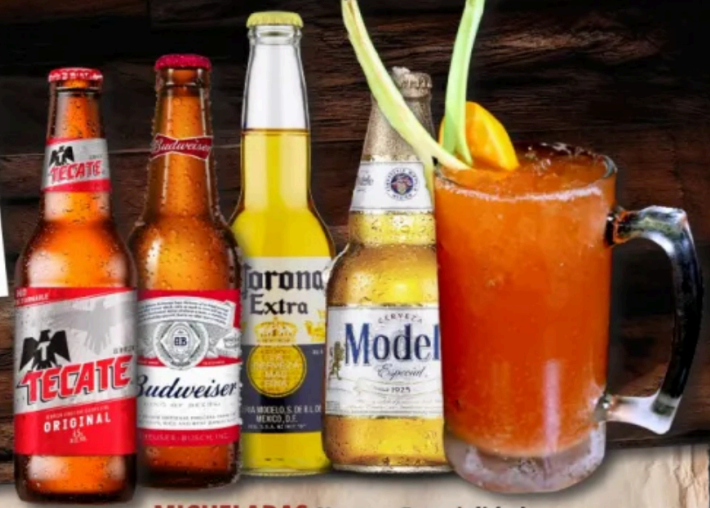
MICHELADAS Nuestra Especialidad Domestic Beer & Tecate Lg. 9. 99 Imported Beer Lg 10. 99