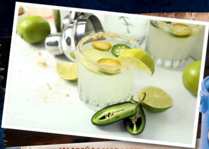
JALAPEÑOS MARGARITA ... 7.99