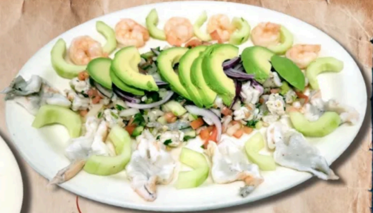
MARISCOS VALLARTA ..... 26.99 MARINATED SHRIMP, COOKED SHRIMP WITH CUCUMBER, AVOCADO AND CEVICHE.