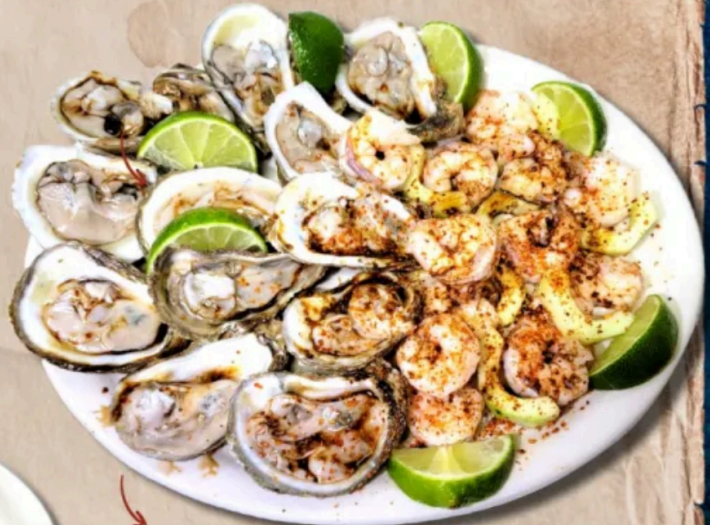
OSTIONES PACIFICA ..... 26.99 OYSTERS, SHRIMP, CUCUMBER, SPECIAL SAUCE, AND TAJIN.

Consuming raw or undercooked meats, poultry, shellfish or eggs may increase your risk of foodborne illness. Please inform your server if you have any food allergies or concerns.