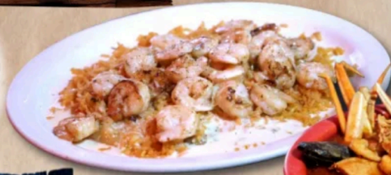
ARROZ CON CAMARON