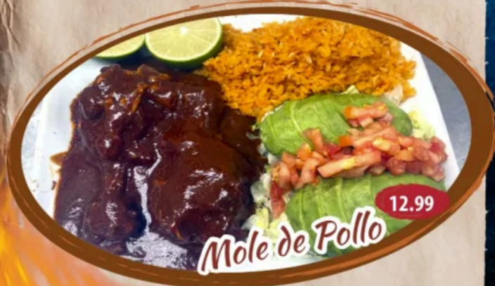
Mole de Pollo