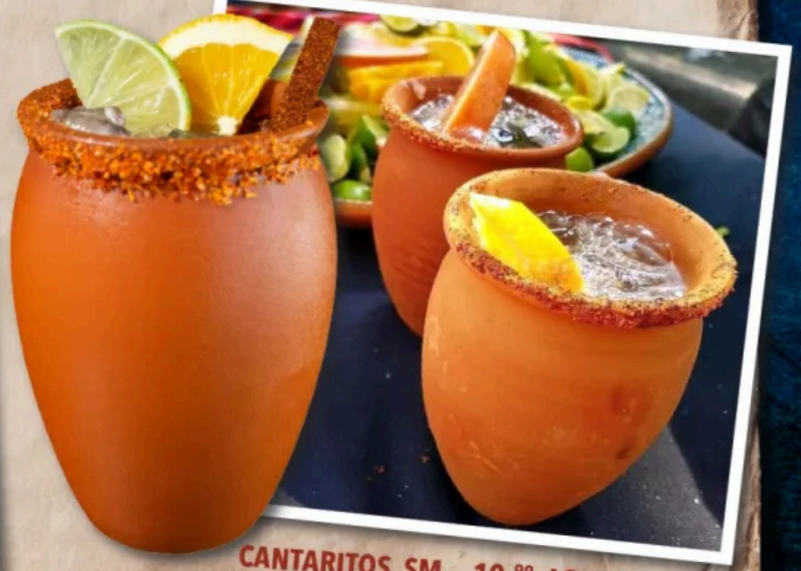
CANTARITOS SM... 10. 99 LG... 15. 99