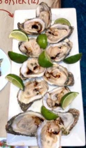
PLATILLO OYSTER (12)