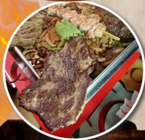
PARRILLADA...26.99 DO YOU WANT EVERYTHING?