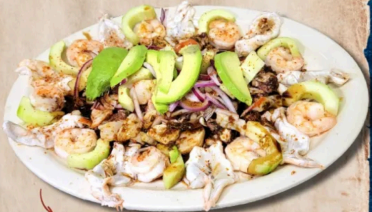
MARISCOS PANCHO ..... 27.99 COOKED SHRIMP, TANNED SHRIMP, OCTOPUS, SCALLOPS, IMITATION CRAB, AVOCADO, CUCUMBER, ONION, AND SPECIAL SAUCE.